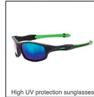
High UV protection sunglasses