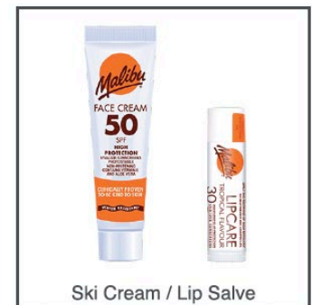
Ski Cream / Lip Salve