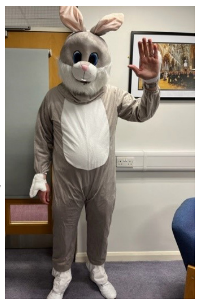
Easter 2023, Whole School Assembly