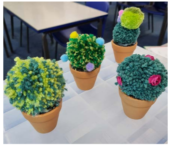
Woollen cacti plants made at Craft Club.