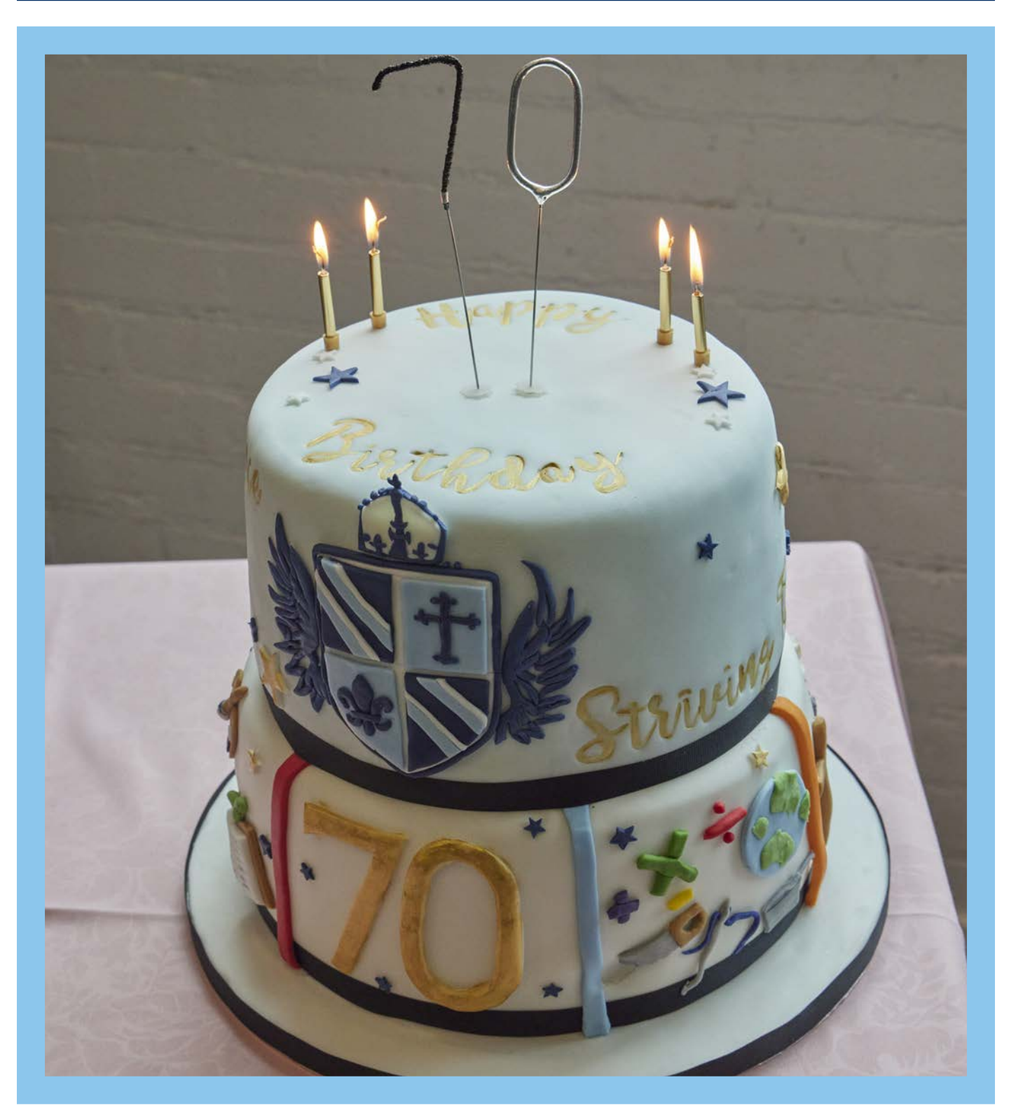
70th Anniversary Celebrations at William Farr School

<u>Christmas Concert</u> <u>Remembrance Day</u> <u>Arkwright Scholarship</u> <u>70th Anniversary Celebrations</u>